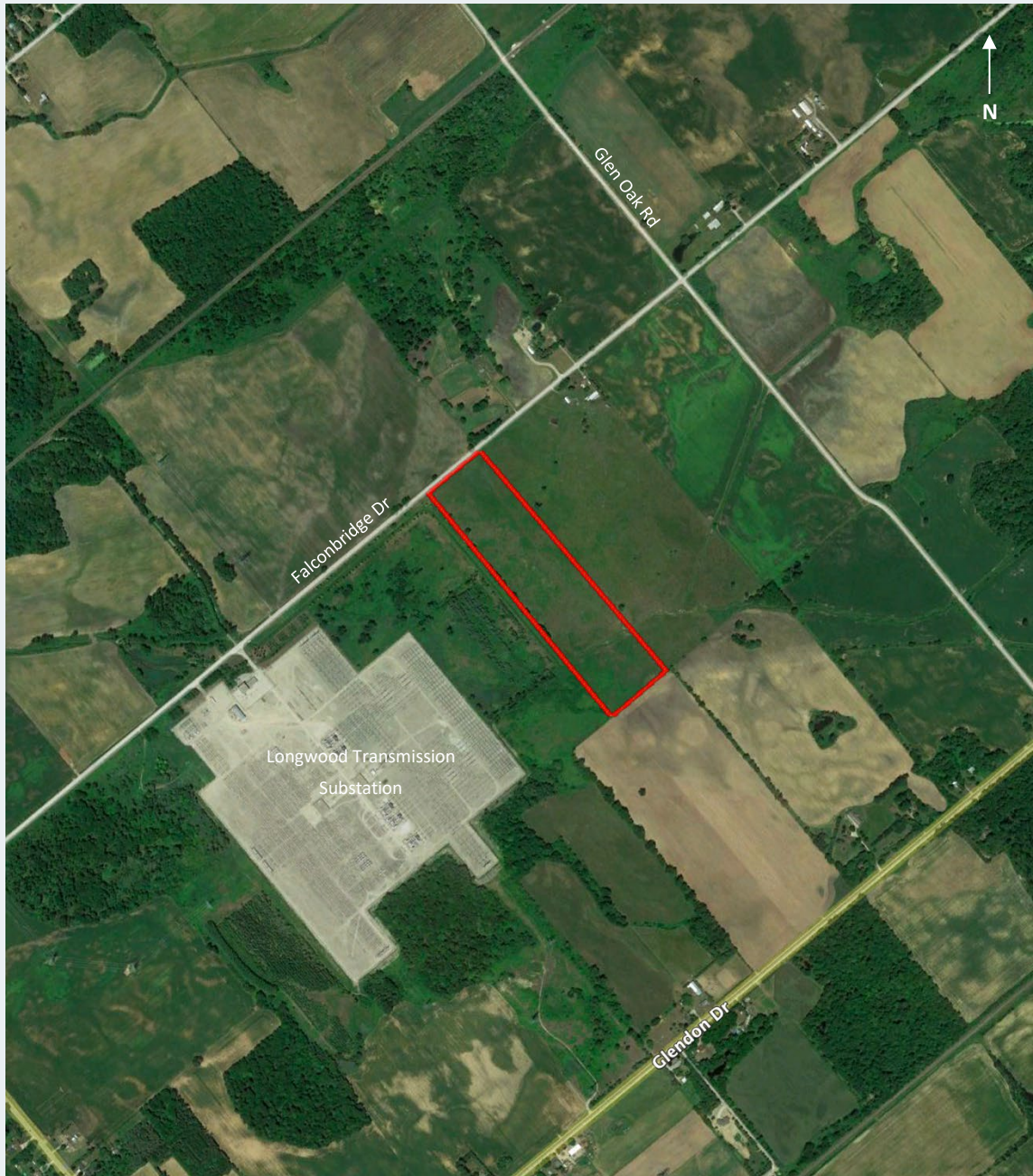
FIGURE 1: GENERAL PROJECT LOCATION